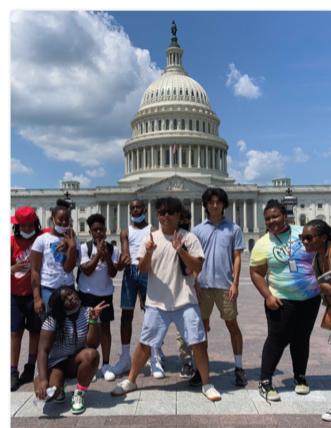
Emerson Collective Youth Collaborative

GW is partnered with the Emerson Collective this summer for an 8-week paid internship! Students from GW and other higher education institutions are encouraged to apply to join us here in DC for the ECYC Summer Internship . Students serving with GW will be part of the GW CIVIC CHANGEMAKERS program in which you will work in DC Middle Schools with children on a civic service-learning program to address concerns locally. Apply here!