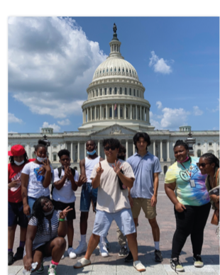
Emerson Collective Youth Collaborative